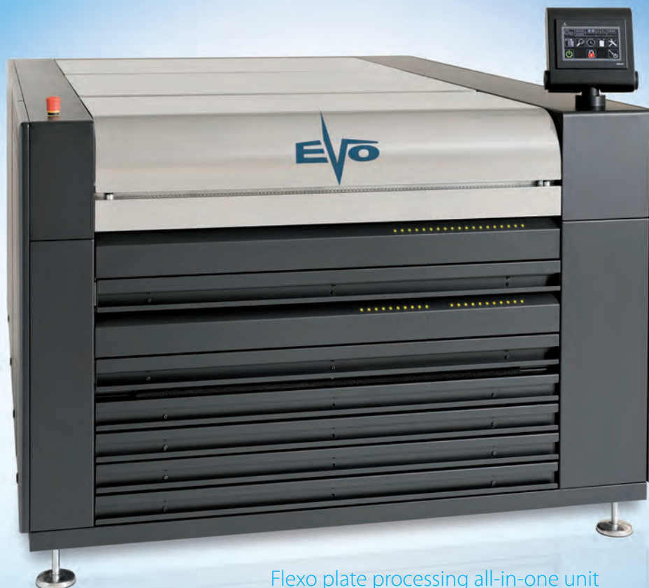
Flexo plate processing all-in-one unit